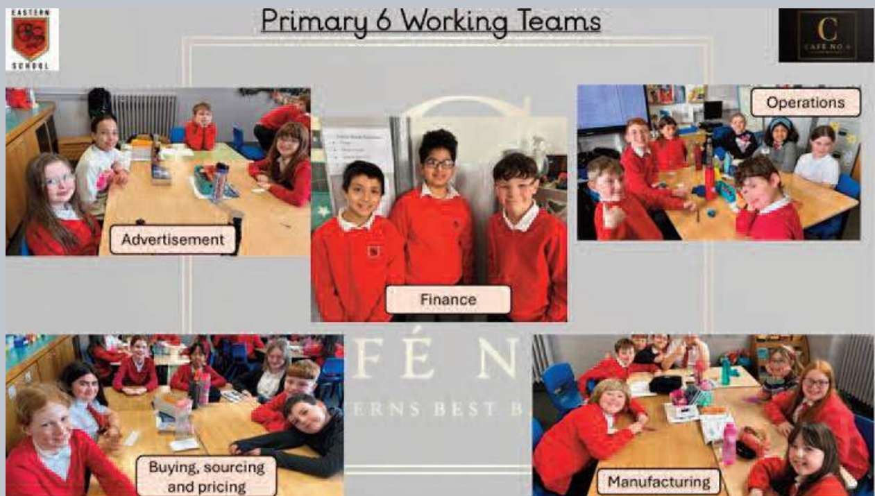
2025 Primary 6 team from Eastern Primary School