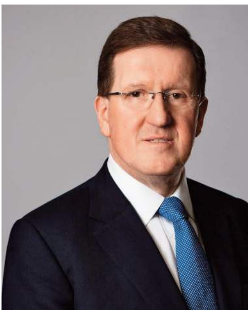
Right Honourable Lord Robertson

This dinner was previously known as the Guildry Ladies Dinner and our last one held on Friday 11 October 2019 was in the Apex Hotel, as the City Chambers were being refurbished. The previous dinner in the City Chambers was held on Friday 23 March 2018. Both these dinners were fully supported, and our guests really enjoyed the events.