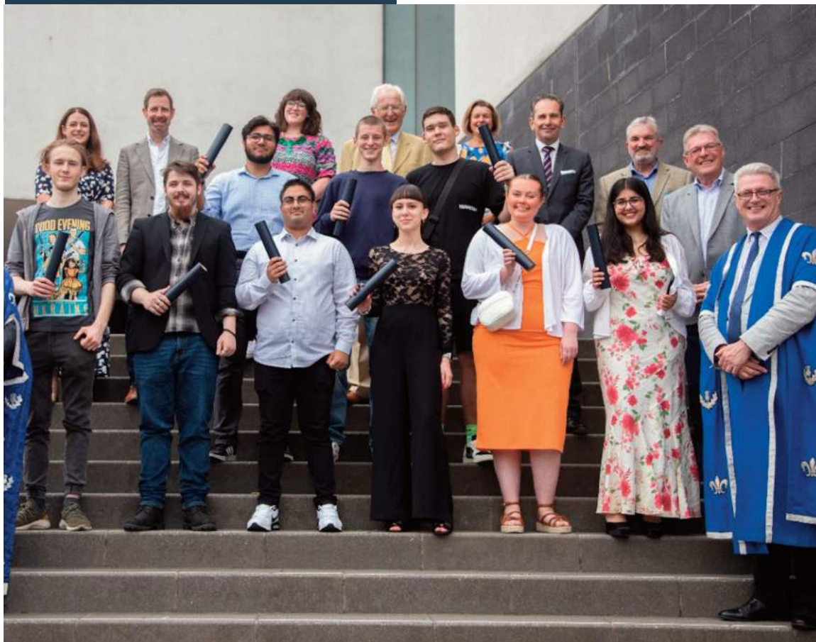
Above: Access Summer School Graduation

We hope that all members of the Guildry feel the sense of satisfaction that comes from the knowledge that we have changed someone’s life for the better and for good.